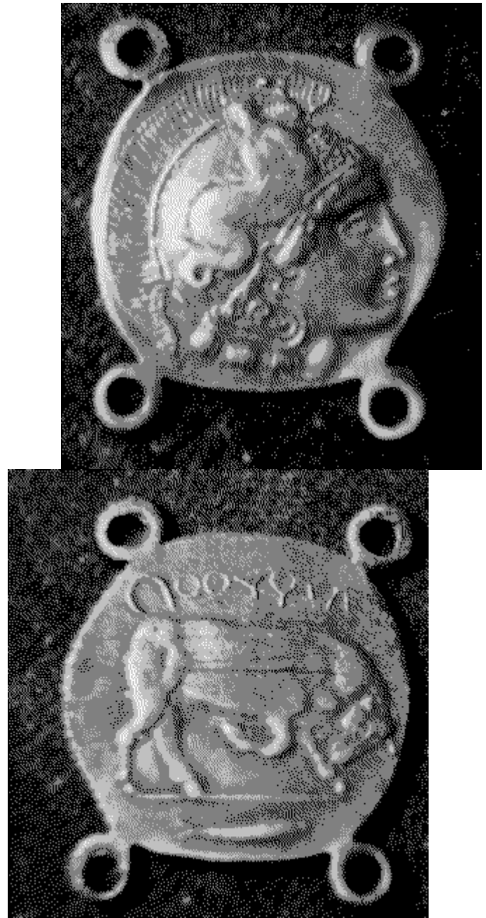
Fig. 11-6 The Thurium Coin, obverse (left) and reverse (right), Terral, Oklahoma.