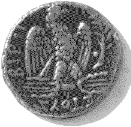
Fig. 11-1 Nero coin obverse[did not print] (left) and reverse (right), Oklahoma.

an eagle holding a thunderbolt, a palm branch, and two inscriptions (Fig 11-1).