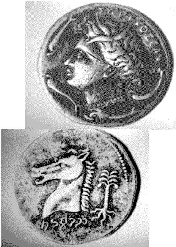
Fig. 11-3 The Alabama coin obverse (left) and reverse (right).

forcefully (Fig 11-3). There was the Arkansas coin in print: the same profile, dolphins, date palm and horse head! The photograph was included in an article by Braithwaite and co-authored by an old friend, Mahan. In fact, it was the symposium paper which I had heard in 1973, rewritten and here illustrated. The coin was identified as having been found in Alabama by a little boy.