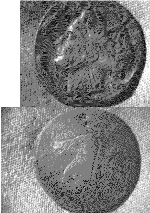
Fig. 11-2 Arkansas coin, obverse (left) and reverse (right).

curly hair was a three-pronged ornament. Around the edge swam four dolphins. The reverse bore the head and neck of a lively horse, facing left. He had erect ears and a short mane. His mouth was open, as if he were snorting. Behind his head was a stylized tree with eight branches, uprooted, showing five crooked roots. Under the horse head was a very worn inscription. Only four of the symbols were now plain. The edge of the coin had once been encircled with a row of tiny dots, worn off except on the sides.