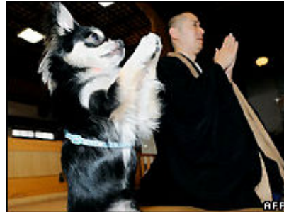
Conan the dog joins the priests at Jigenin temple at prayer time

Attendance at a Buddhist temple in Japan has increased since the temple's pet, a two-year-old dog, has joined in the daily prayers.