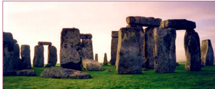
Stonehenge : the subject of renewed archaeological interest