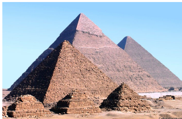
The Pyramids of Giza, Egypt, of Menkaure's three queens in front of the pyramids of Menkaure, Khafre and Khufu.

It's Pi Day, a celebration of the mathematical ratio that man has been trying to unlock for millennia. But why are we driven to find the answers behind it?