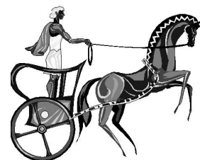
Man and animal working together for mutual benefit, with the man holding the reins.