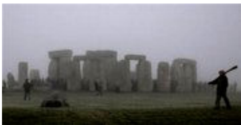
Stonehenge on Salisbury Plain in southern England Dec 22, 2006.

Some 80 bluestones, weighing between one and four tonnes each, were transported by land and sea from South Wales to the Salisbury Plain site between 4,500 and 5,000 years ago.