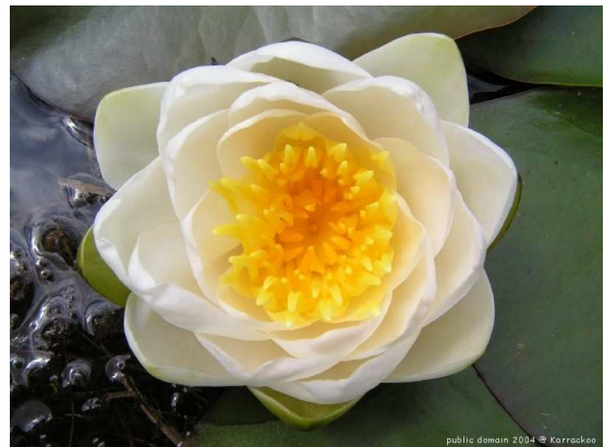
The White Lotus

Therefore, we must interrupt this chain of cause and effect. We Theosophists have the function to open man's heart for true love. We should be ourselves good examples. This is the only chance we have to root out the main cause for Aids.