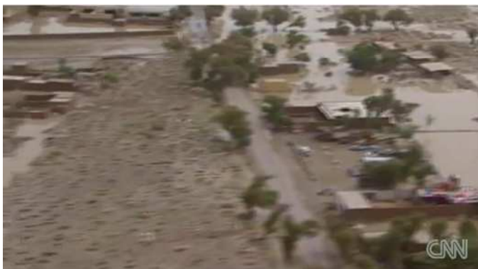
CNN footage of Pakistan's flooded areas

The monsoon season began and Pakistan is being devastated by heavy flooding. According to the country's prime minister this is the nation's "worst-ever calamity". More than 2 thousands deaths, 4 millions of homeless and at least 20 million people have been affected by this natural disaster.