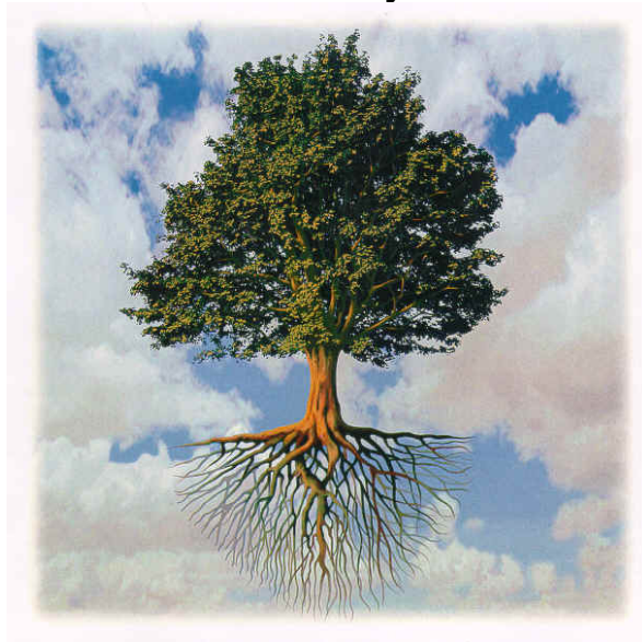
The Inner Tree of Life Transcends Every Noise

“The sparks that fly forth from the mouths and pens of a few visible and noticed workers have their origin in the inner living fire kept ablaze by the many who go unnoticed.”