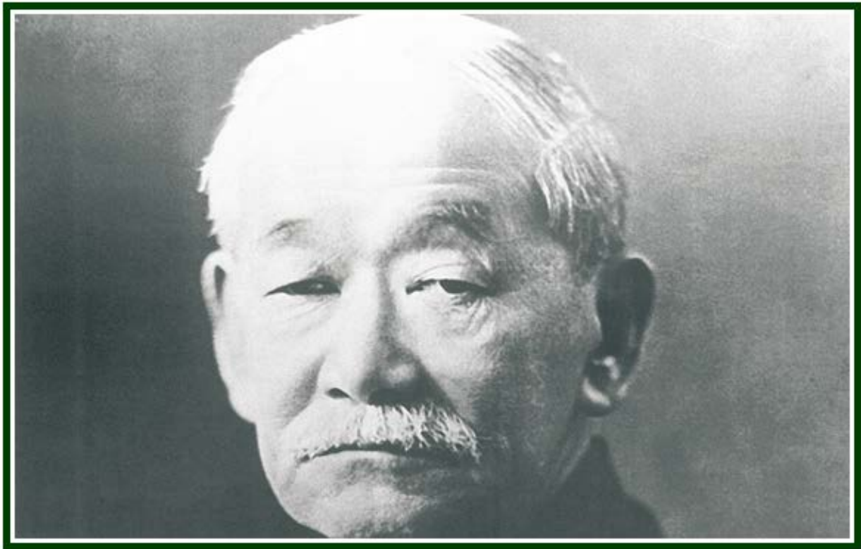
Jigoro Kano, the founder of Judo

* E ven when we do what we believe to be best, overdoing something can be harmful. (...) Diligence is good, but one must be diligent in moderation, to an appropriate extent. [1]