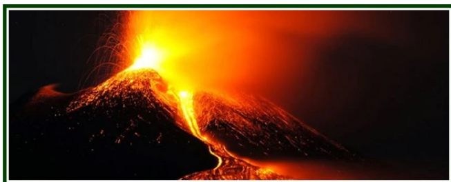
A volcanic eruption