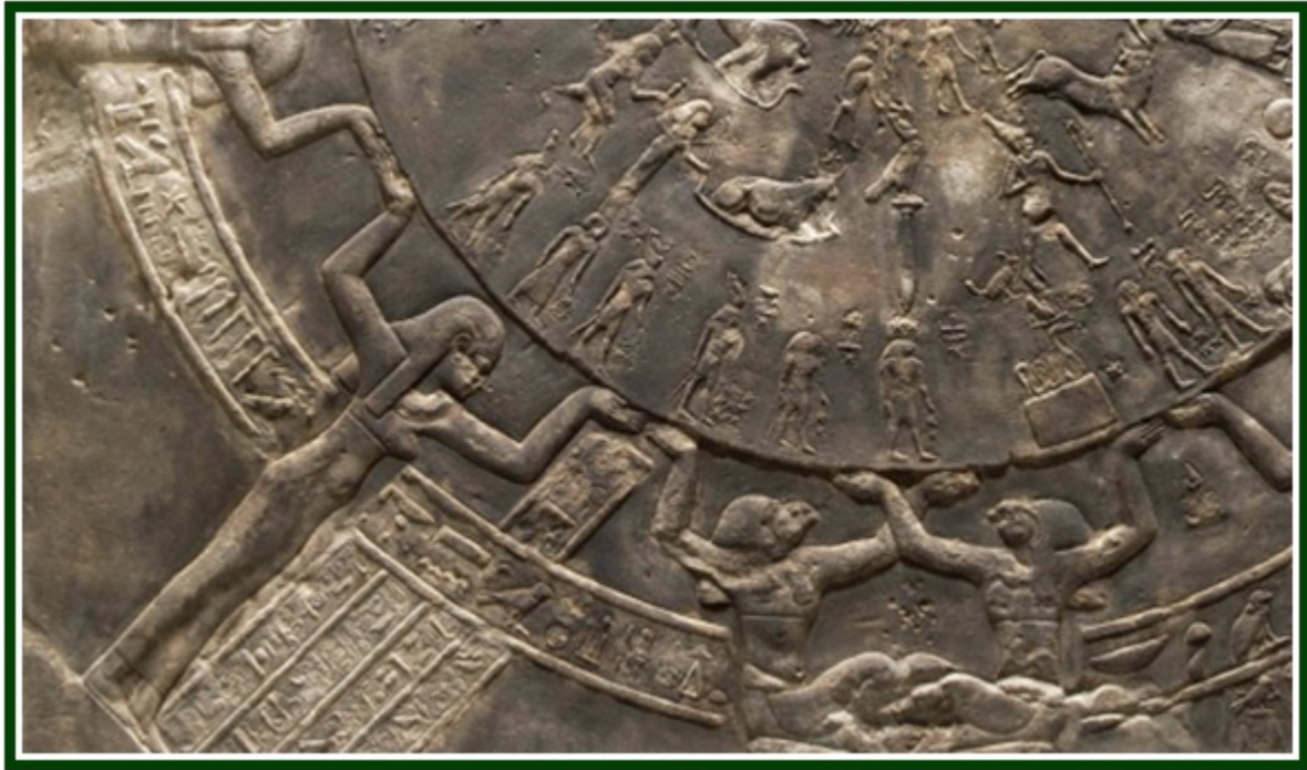
Partial view of the Dendera Zodiac, of ancient Egypt, now in the Louvre Museum, France.

(From Vol. II, pp. 431-433 in “ The Secret Doctrine ”)