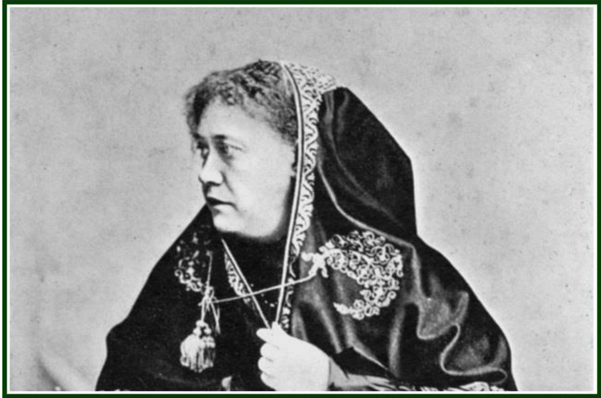
H.P. Blavatsky (1831-1891)