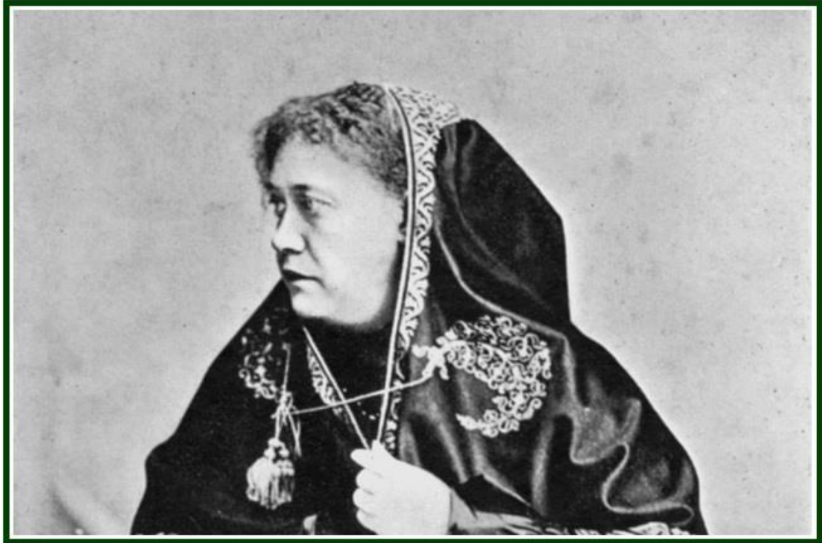
H.P. Blavatsky (1831-1891)