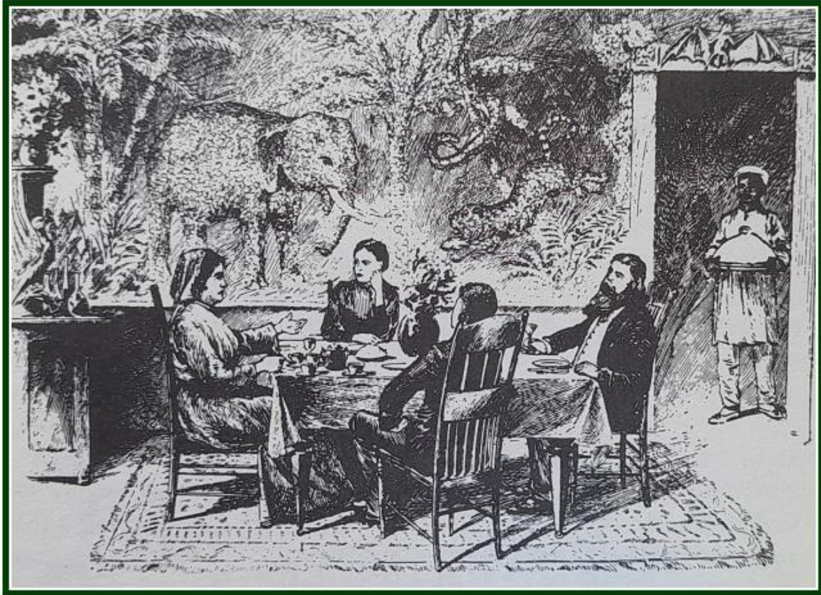
A contemporary drawing: HPB and friends at the dining room of the Lamasonry

[Image reproduced from Sylvia Cranston's book "HPB", p. 172]